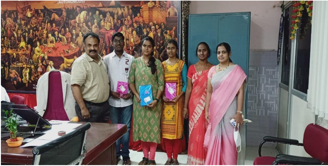
Students awarded prizes

Department of Biochemistry & Food technology