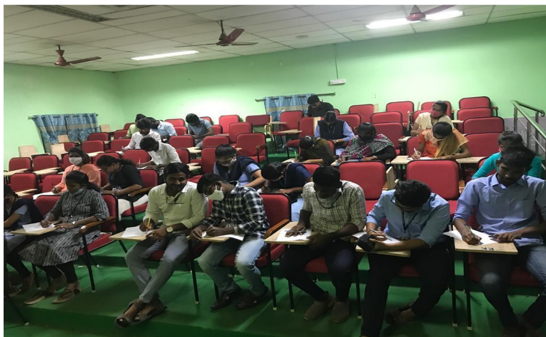
Students taking part in the essay writing competition